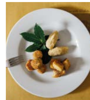
Baked tench according to Grazia Rossi's "La Villetta" recipe

It's really important for us to use local producers. We use cheeses like Stracchino from Vigro, a village overlooking Lake Iseo, plus Quartiolo and Taleggio from Colosio Formaggi. We have our own kitchen garden for vegetables and use a range of small local butchers for our meat. The maize flour we use for our polenta comes from Le Ventighe, a 15th-century farmhouse just around the corner – now that's local! We also try to use Slow Food products.