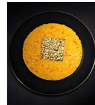
Gold rice and saffron from Gualtiero Marchesi