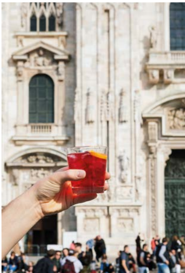
Photo Below_ Aperitif in Piazza Duomo