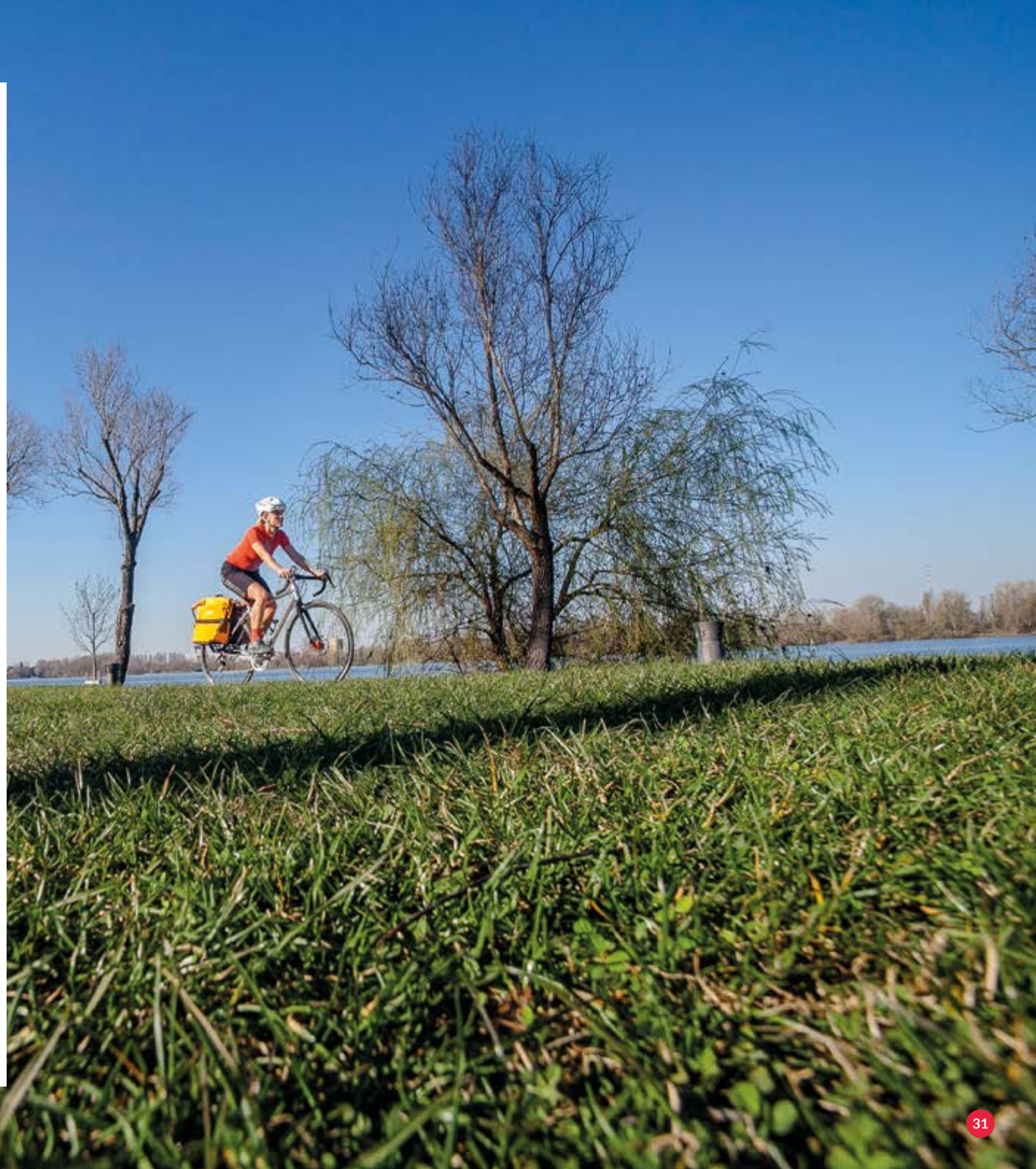
Photo Glimpes of the Mincio Cycling Path